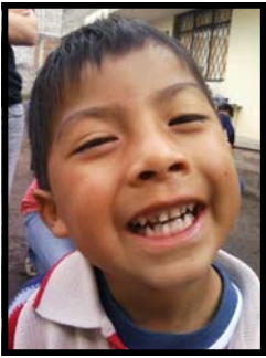
What a smile!

While our teachers were still teaching, another team arrived, this time from the Richvale Bible Church in Canada. This particular team was a youth