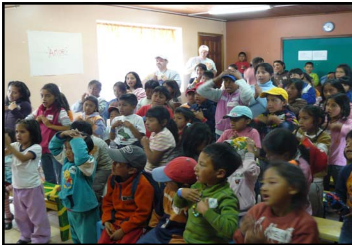
Cristo es la Roca de mi salvación...

This summer has been a whirlwind of people change. They were people who didn't necessarily go searching for personal change, but rather opened themselves up to the possibility that maybe...just maybe...God was looking to change them. Isn't that always how God works? I once heard someone say "If you want to make God laugh, tell Him your plans." I think that God does enjoy changing our plans