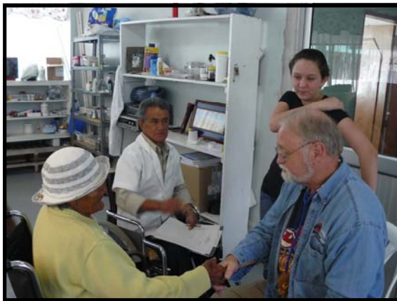
The healing power of touch.